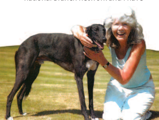
Jilly Cooper is one of several high profile supporters of the Trust

Our promotional and public relations programme was co-ordinated by RGT staff, with the support of various agencies. The aim has to be to increase awareness of both the suitability of greyhounds as pets and the work of the Trust.