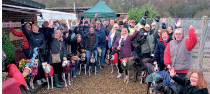
Volunteers at the Croftview RGT Christmas Party

All of the above results were derived from continuing activities. The Charity has no recognised gains or losses other than those dealt with in the Statement of Financial Activities.